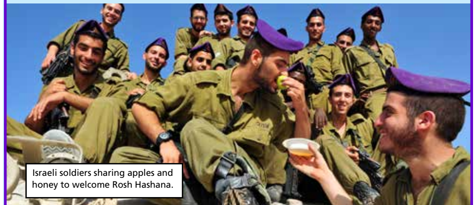
Israeli soldiers sharing apples and honey to welcome Rosh Hashana.

Babysitting will be available during Rosh Hashana Day 1 and Yom Kippur morning services.