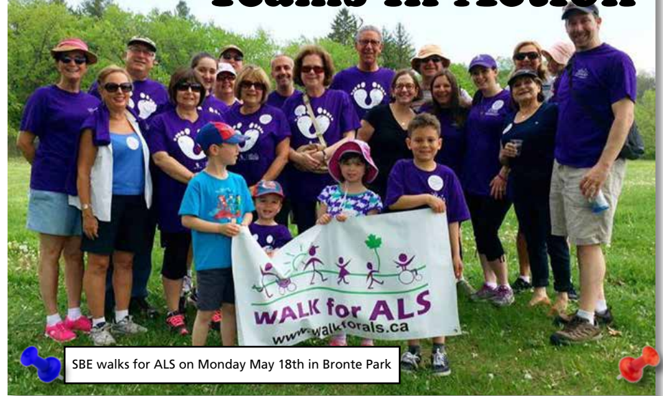
SBE walks for ALS on Monday May 18th in Bronte Park