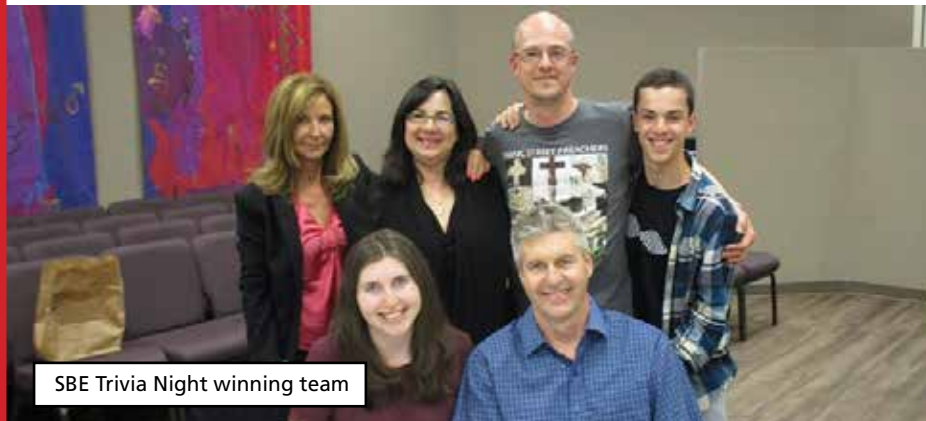
SBE Trivia Night winning team